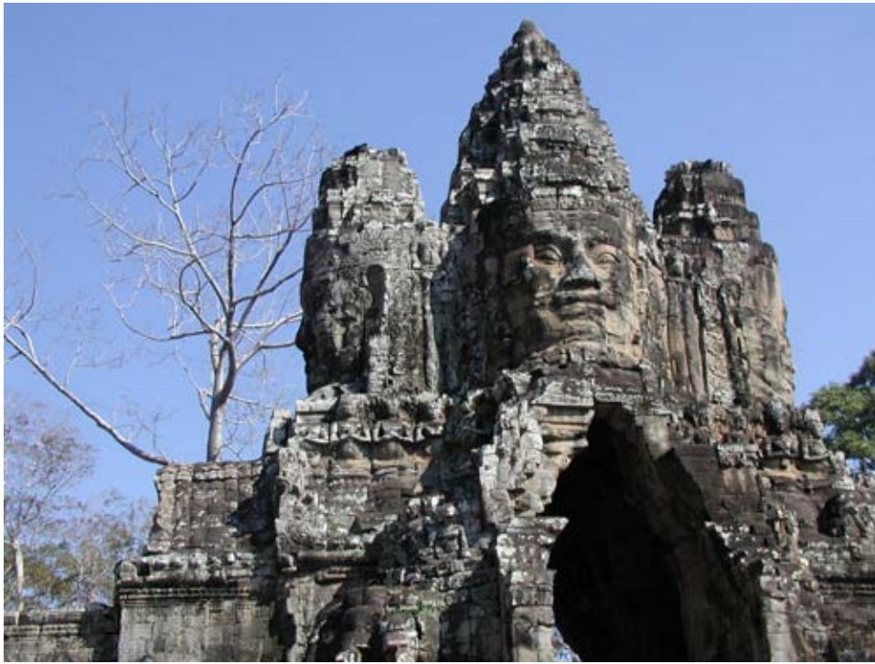
Entrance to Angkor Thom

Entrance to Bayon which is the major complex in Angkor Thom. Built in the late 12th century or early 13th century as the official state temple of the Mahayana Buddhist King Jayavarman VII, the Bayon stands at the centre of Jayavarman's capital, Angkor Thom. Following Jayavarman's death, it was modified and augmented by later Hindu and Theravada Buddhist kings in accordance with their own religious preferences. The Bayon's most distinctive feature is the multitude of serene and massive stone faces on the many towers which jut out from the upper terrace and cluster around its central peak.