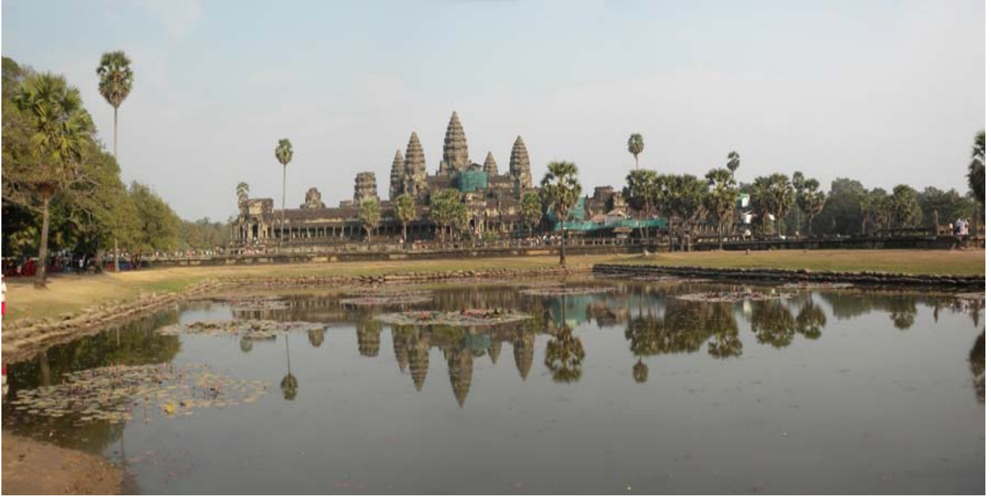
Angkor Wat from the front causeway

To say it is magnificent, does not do it justice. The bas relief carvings, the architecture, the engineering, the human effort all combine to make this truly the 8 th wonder of the world.