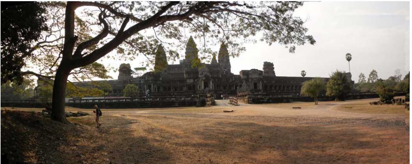
Rear of Angkor Wat.