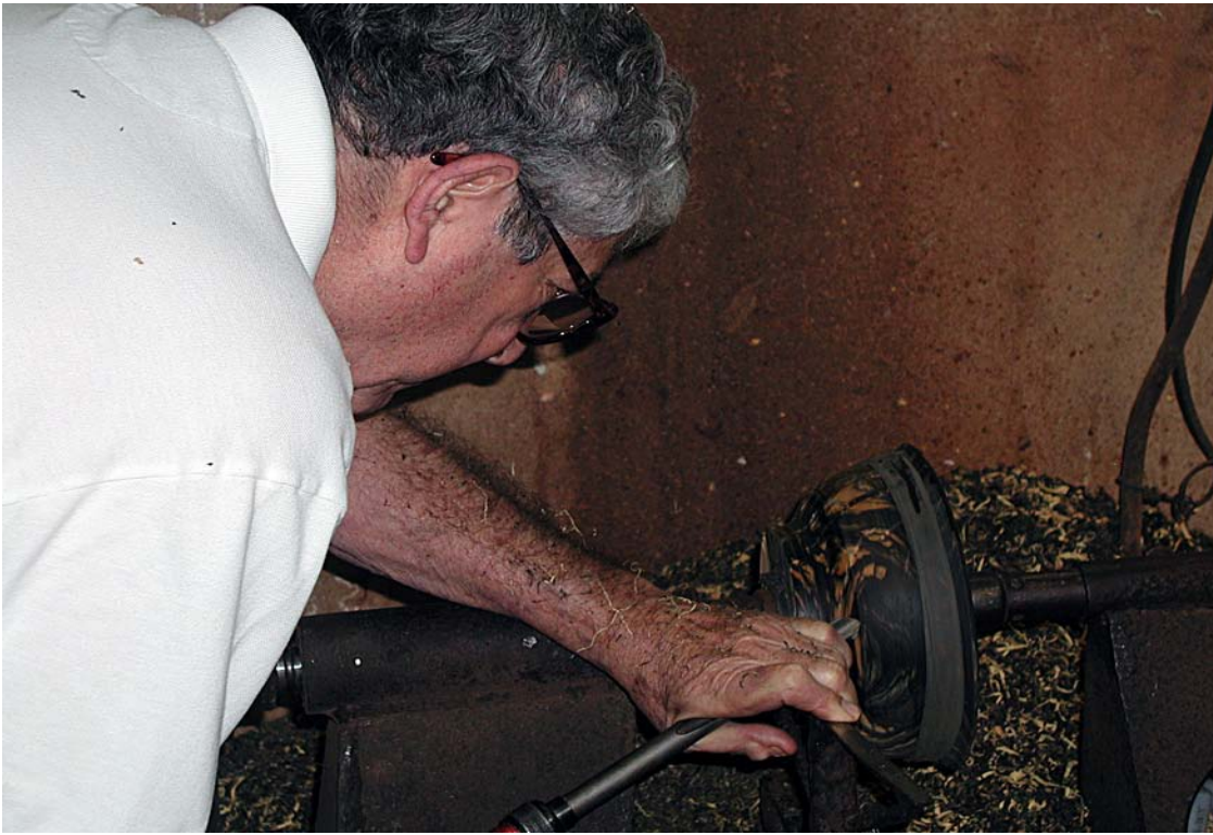
Close up of tool technique.