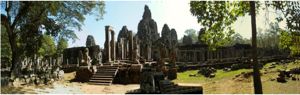
The Back of Bayon

About 4:30, after a long afternoon rest we headed out to Tong Le Sap for a boat ride on the Lake and a sunset view. We boarded a small boat, a real challenge for me, as it was bouncing up and down, and motored to the lake. Once there we got off of the boat, another challenge, onto a floating platform with tables and chairs.. This “barge” was attached to bamboo logs that kept it afloat. We had something to drink and watched as the sun dipped into the lake. On the way back the boat’s engine seemed to be heating up, so the operator was very careful about his speed.