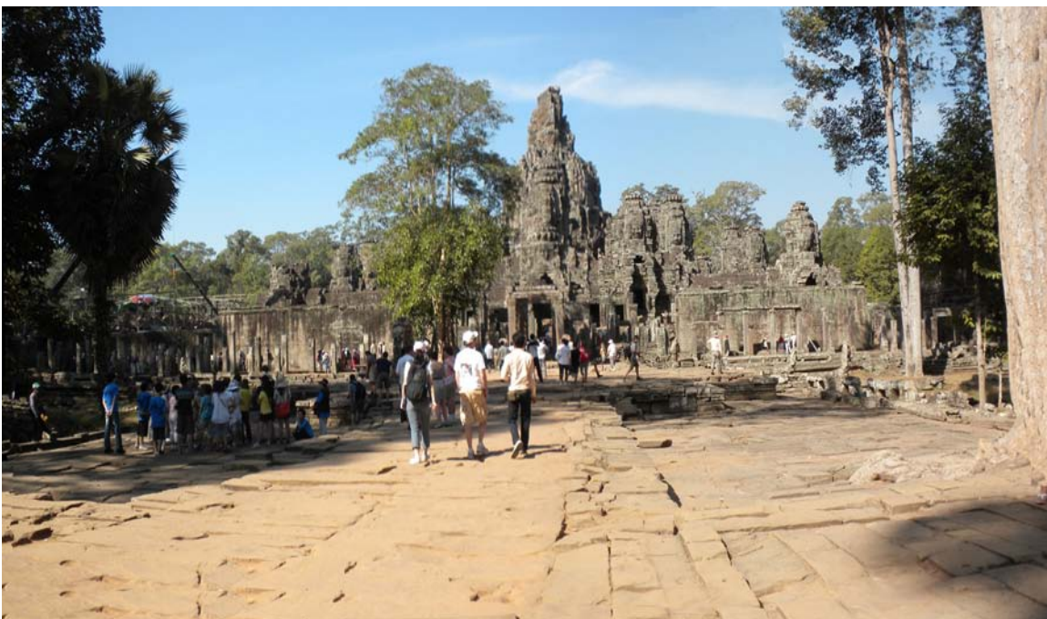
Entrance to Bayon

Entrance to Bayon which is the major complex in Angkor Thom. Built in the late 12th century or early 13th century as the official state temple of the Mahayana Buddhist King Jayavarman VII, the Bayon stands at the centre of Jayavarman's capital, Angkor Thom. Following Jayavarman's death, it was modified and augmented by later Hindu and Theravada Buddhist kings in accordance with their own religious preferences. The Bayon's most distinctive feature is the multitude of serene and massive stone faces on the many towers which jut out from the upper terrace and cluster around its central peak.