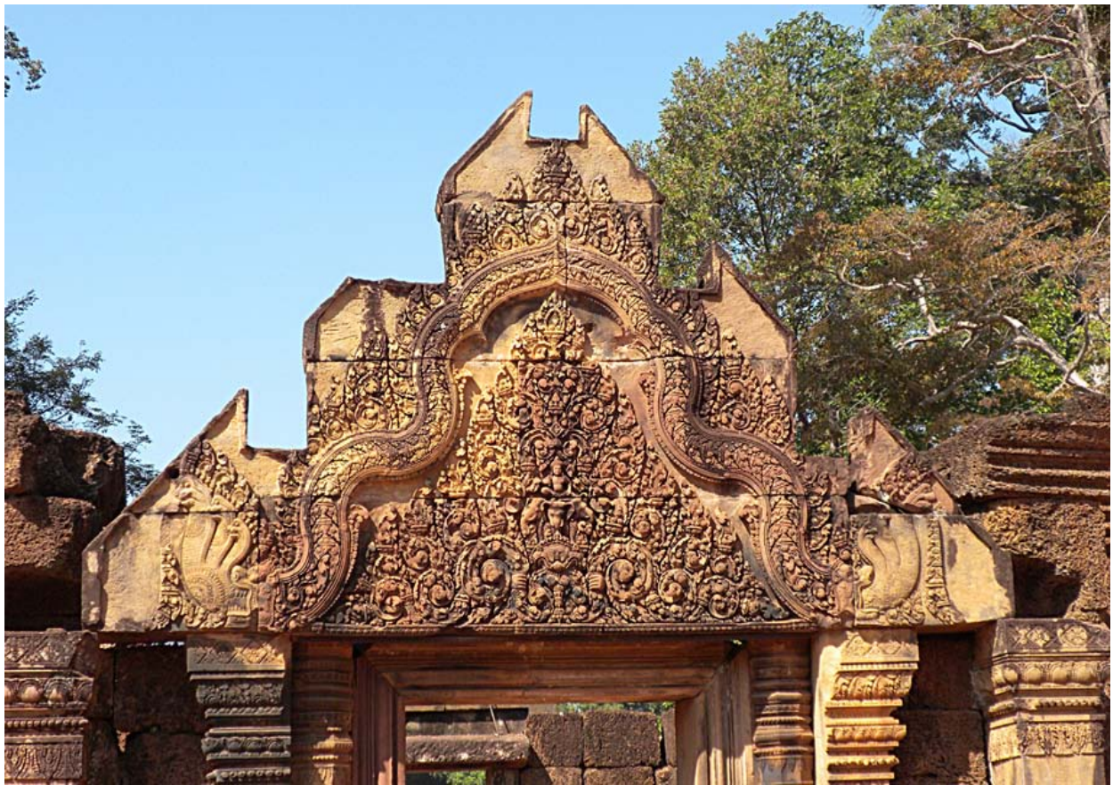
Entrance to Bateay Srei showing intricate carvings.

We had enlisted the services of a guide during our trip and he proved very knowledgeable. He recalled, with some nostalgia, as a boy being able to just go to Angkor and fish in the ponds/moats there unrestricted. He was able to direct us to this carving, which for the life of me looks very much like a stegosaurus dinosaur.