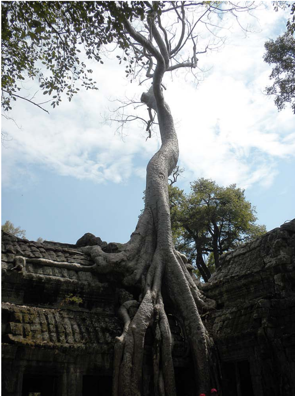
There are many trees growing on top of the remaining structures.

Some idea of the time required to build this structure and the labor required was revealed to us on the site. We heard a large engine grunting and puffing, and were amazed to see a wire cable embedded with industrial diamonds cutting blocks of the stone, the same kind of stone that was used in the temple's construction. This machine and its operator were able to cut 2 to 3 blocks a day. Imagine then, although it does stretch what is believable, how many workers were required to cut the thousands of blocks needed to build this monument and all of the others in Angkor without the aid of machinery.