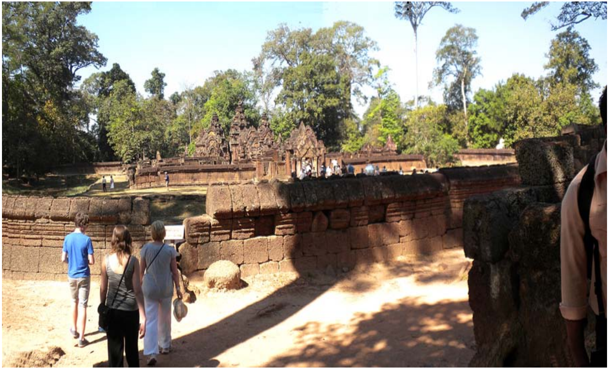
An interior view of Banteay

We spent 2 days at Angkor – time well spent. In some places they have left the vegetation that had invaded and taken over (or reclaimed back to its natural state, depending on your point of view). Wonder what their Homeowners Association HOA said about this one.