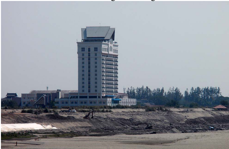
Done Chan Hotel

All the food stalls and restaurants that used to be there have disappeared. Maybe they just moved somewhere else.