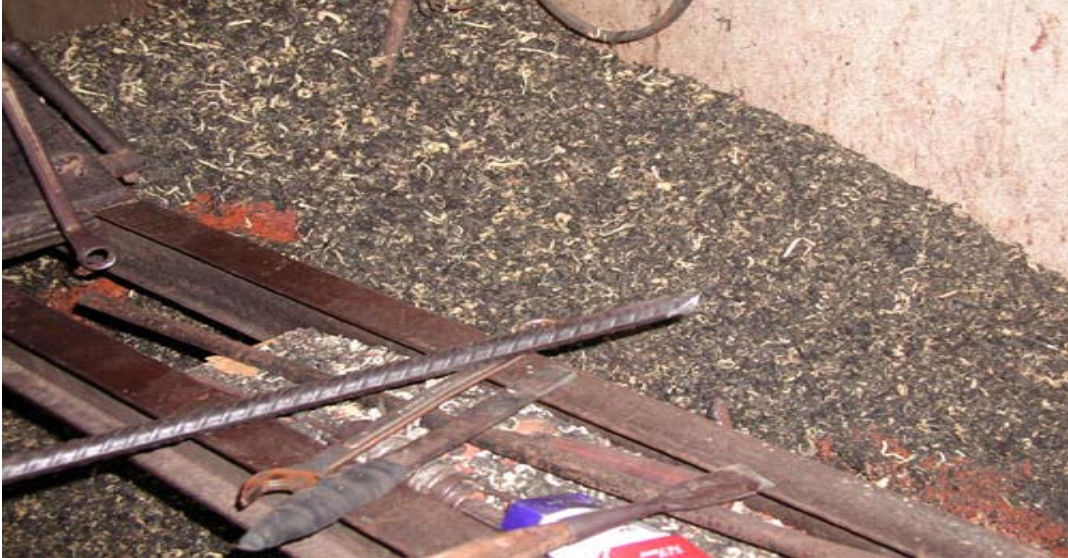
Howie demonstrating the use of a gouge to shape an ebony bowl.

Re-bar ground to a point and used as a scraping tool. Very dangerous.