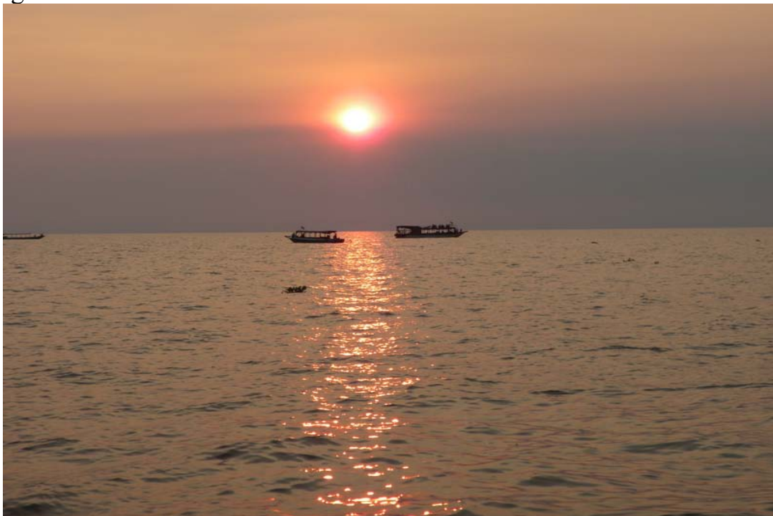
Sunset on the Tong Le Sap

Tong Le Sap in Cambodian means. "Large Fresh Water River," but more commonly translated as "Great Lake," It is a combined lake and river system of major importance to Cambodia, and the Mekong delta. This is a lake that grows during the rainy season from the inflow of the Mekong River. During the dry season it loses water back to the Mekong. The Tong Lé Sap Lake provides around 50% of the dry season flow to the Mekong Delta in Vietnam. It is a huge fishing bonanza for the Cambodian economy, and as the lake level falls crops are planted on it's fertile sloping banks.