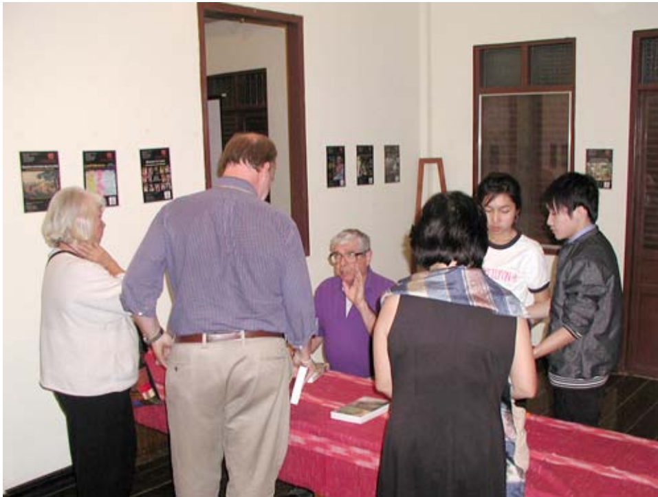
Signing books after book talk.

Went to Sticky Fingers for dinner, and the dish we craved for, Ribs, was not available so I had to settle for a Smoked Salmon Caesar Salad. Oh, the sacrifices one must make when traveling. They promised us that ribs would be available tomorrow night.