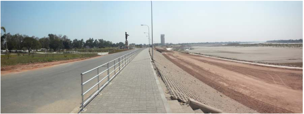
Another view of the river bank improvement project showing the river, The Done Chan Hotel and the Statue of King Anouvong The Great.