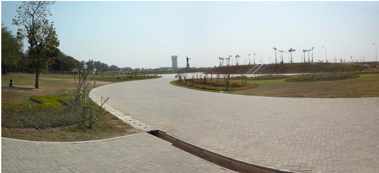
River bank improvement with the Done Chan Hotel in the distance.

Had breakfast at the hotel, not as good as the Scandinavian Bakery, and took a walk along the newly built Mekong River bank restoration project. It looks very impressive, but I am not sure that it will help prevent flooding or preserve the bank. The banks look at least 100 meters wider than they used to be. This narrowing will speed up the river's flow thereby increasing the cutting force of the river on the rebuilt banks.