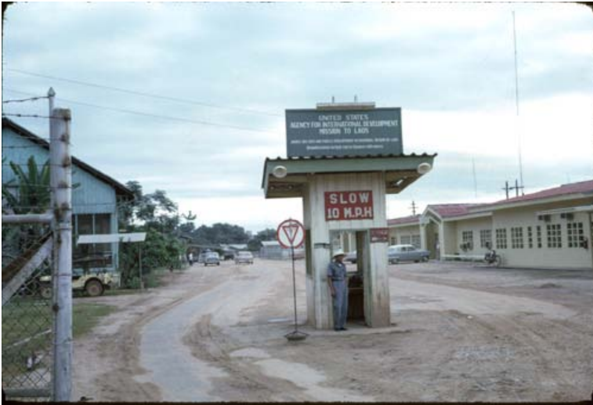
Entrance to USAID compound about 1964