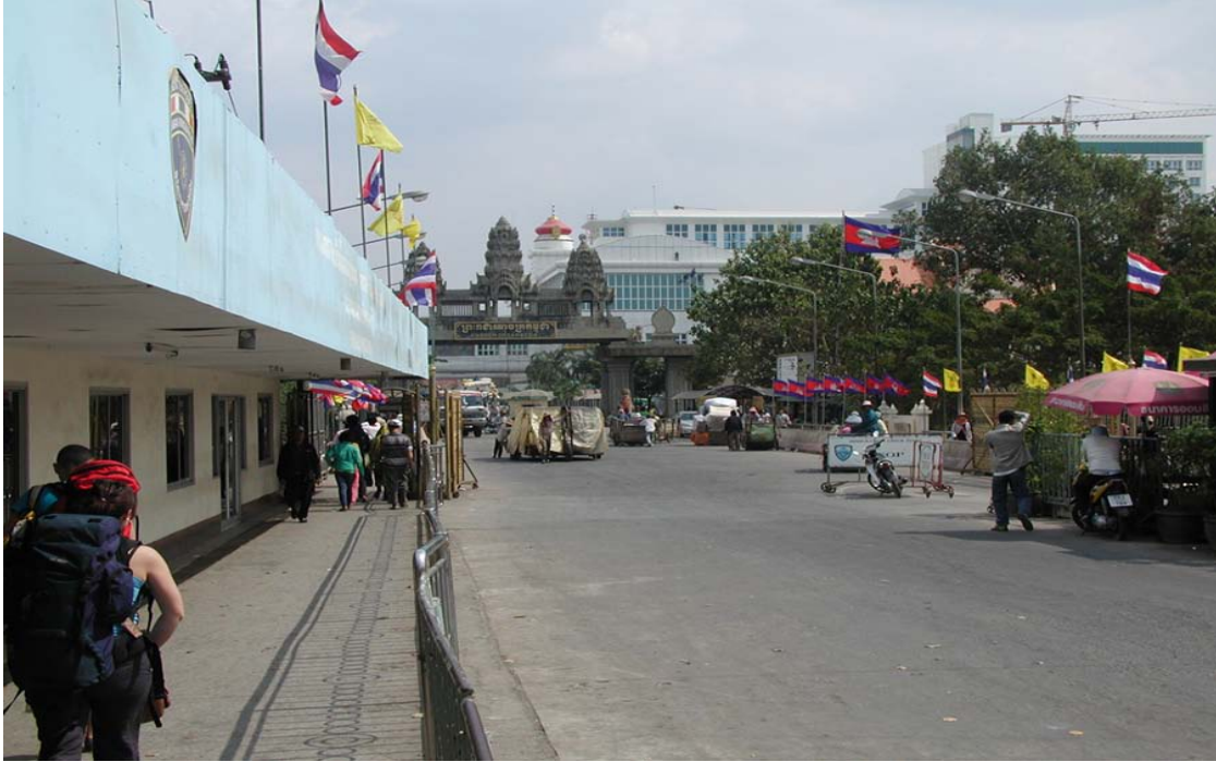
Road that leads to the immigration office to get signed into Cambodia.

get stamped out of Thailand. Unloaded our baggage into a rickety wooden cart, the official made arrangements to have it delivered to the Cambodian side, and then we proceeded to the Thai immigration office to actually get stamped out of Thailand. This took about an hour because they were short handed. Then we walked about \frac{3}{4} km. crossing the actual border into Cambodia, then to the Cambodian immigration office to get stamped into the country, in Poipet.