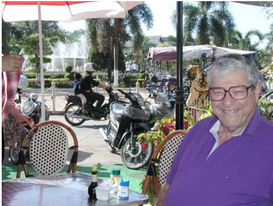
Seated at the Scandanavian Bakery, with the Nam Phu in the background.

Eating breakfast one morning at the Scandanavian bakery (Nam Phu fountain in the background), my attention was drawn to a group sitting at the tables next to me outside. I couldn't identify the language, but from their references to various counties, I gathered that they had done quite a bit of traveling around the world (i.e., were fairly well off). They had an infant with them and, apparently, the grandmother was also part of the group. When the mother started breast feeding the infant right at the table, it struck me as a bit inappropriate, at least in Vientiane. But I just marked it up to cultural differences. After feeding, as is the natural course of things, it came time to change the diaper. Rather than retire to the bathroom, the mother and grandmother decided to take the infant to one of the tables inside the restaurant and change the diaper there. I had to wonder what kind of culture changes diapers on restaurant tables while food is being served. While I couldn't identify the nationality specifically, they were definitely northern European, probably Nordic of some sort. Guess that's ok there or maybe just when you're visiting more backward "primitive" areas.