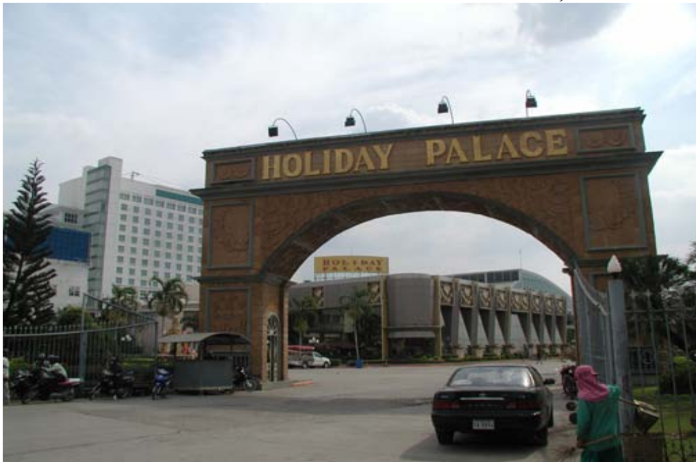
One of the many gambling casinos in the "enterprise zone."

This road we walked on went through the Free Economic Zone, and we counted at least 5 gambling casinos. Then we were funneled into a fairly narrow corridor to await the processing. This exercise took an additional one and a half hours because at first, there was only one clerk,